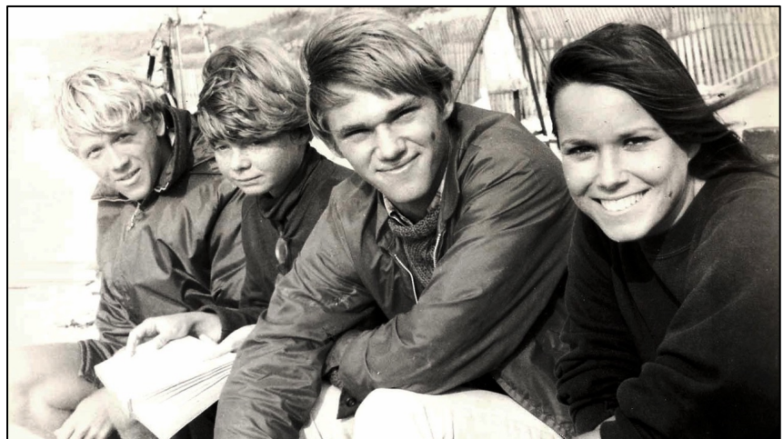
The cast of Last Summer , L to R: Bruce Davison, Cathy Burns, Richard Thomas and Barbara Hershey

primal rituals of late adolescence. The film captures how teenagers actually behave, talk, and think. It places the viewer inside their heads while simultaneously dissecting them from the outside. Dan is the smart-ass - a carefree jock, self-centred and seemingly lacking in conscience. Peter is more sensitive - a worrier who questions his own behaviour and sometimes feels guilty. Sandy is mature beyond her years and claims to have an IQ of 157, but she's insecure, controlling and cruel. She leads the group to humiliate Anibal, a lonely Puerto Rican she tricks into a computer date, and continually